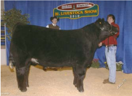
First Overall and Grand Champion Continental Division Houston Owens – Bred by RSE Farms